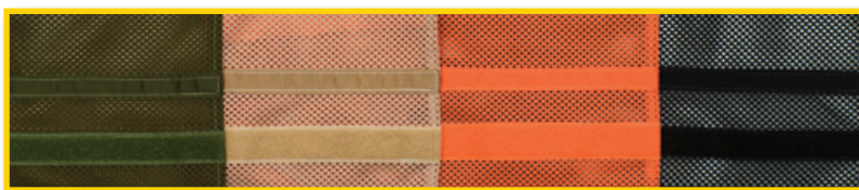
Available stretcher colours

The Micro Stretcher is available in military spec green, sand, standard emergency orange and black to suit all market requirements.