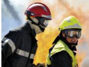
Helmets for forest fire and rescue missions