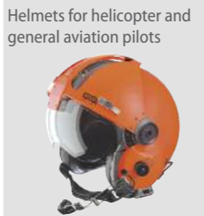
Helmets for helicopter and general aviation pilots