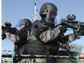
Helmets and hearing protectors for special forces